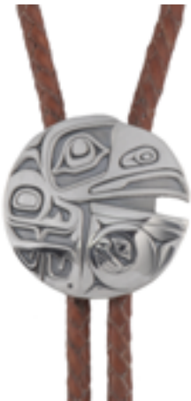
The finished slide.