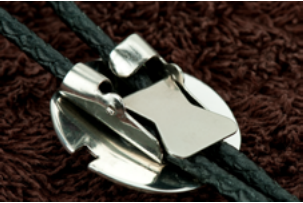
The Bennet Clasp, attached to our bolo tie cord.