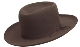
Bushman, Pinched Telescope (1)

To form a pinched telescope, first push in the top to form a teardrop shape pointed towards the front with the section towards the back rounded. The front is typically higher than the rear (1). The inside of the pushed-in top is then raised into a dome so that it does not touch the head, leaving a valley between the dome and the sides. The top of the dome should normally be about level with the top of the sides, a little above the top of the back. The pinch is added to the front by putting two small dents right and left of center. The front of the brim snaps down (2).