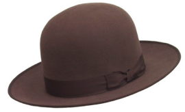
Squatter, Open Crown

The Aussie Slouch is the standard issue hat of the Australian army. It is usually bashed with a center crease, squared off in front and back, and with two long side dents near the top. The brim may be worn flat for maximum protection from the rain or sun, or snapped up on the side.