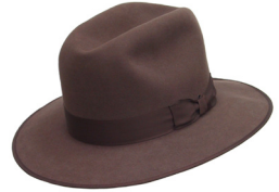
Squatter, Safari Bash