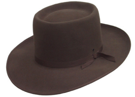
Bushman, Open Telescope (2)