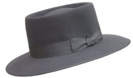
Squatter, Open Telescope