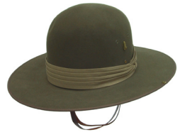
Slouch, Open Crown