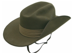
Slouch, Brim Up