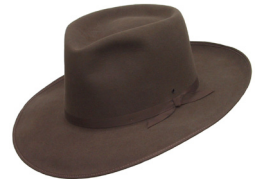
Bushman, Pinched Telescope (2)