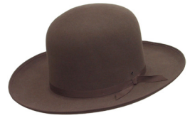
Bushman, Open Crown

The Bushman, the traditional hat of the Australian Outback, may be worn with a fedora-style bash, but is more commonly worn with an open or pinched telescope bash. To form an open telescope, first push in the top of the crown evenly all around to the height you prefer. The front, sides and back should all be the same height (1). The inside of the top is then raised into a uniform dome so that it does not touch the head, leaving a valley between the dome and the sides (2). It is usually preferred to have the top of the dome about the same level as the top of the sides. The front of the brim is usually snapped down.