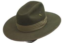
Slouch, Center Crease